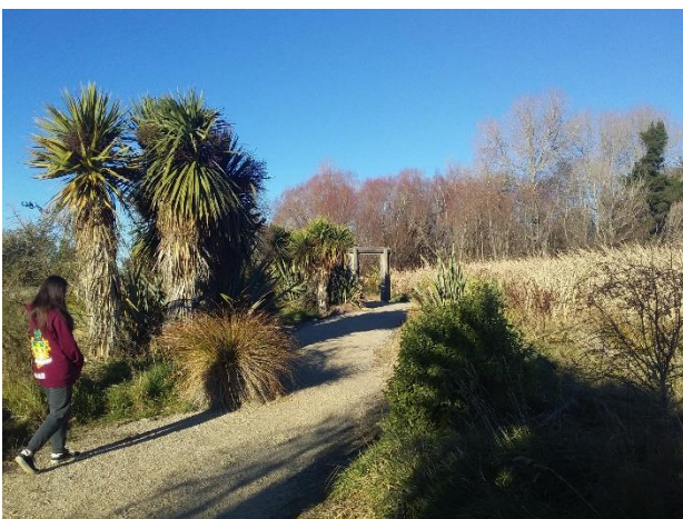
Photographs taken at the Duntroon Wetland.