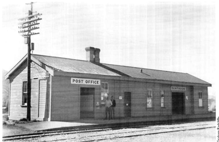
Duntroon Post Office (n.d.)

Question: In what year did the manual exchange hours change from 7am to 9pm to 6am to midnight?