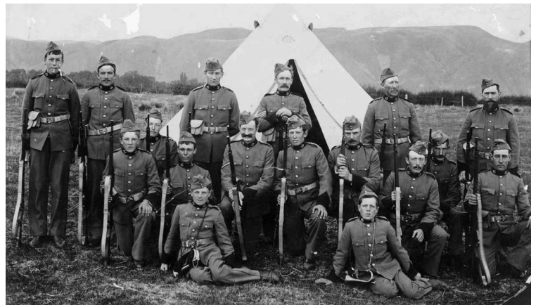
Number 3 Section Duntroon Rifles 1901 Collection of the Waitaki Archive. Id 100739